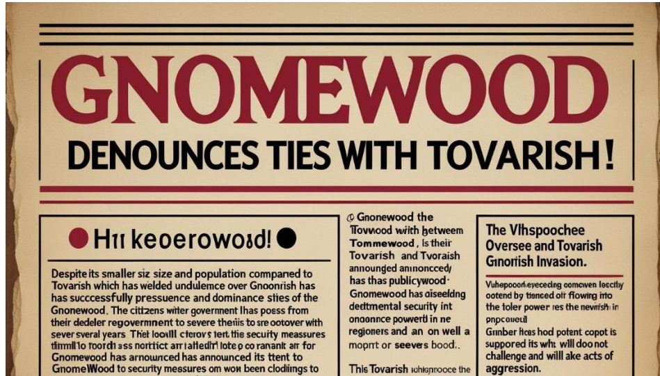
Exhibit 2 BREAKING NEWS: May 4, Year XXXX Gnomewood Denounces Ties With Tovarish!!

Despite its smaller size and population compared to Tovarish, which has wielded undue influence and dominance over Gnomewood, the citizens of Gnomewood have successfully pressured their government to sever ties with Tovarish. This pressure arises from their discontent with their quality of life over the past several years. Considering the potential conflict between Tovarish and Gnomewood, Vuhspoochee has publicly announced its intention to enhance security measures to Gnomewood. Since this announcement, additional military support has been observed flowing into Gnomewood, further deterring any potential Tovarish invasion. The Tovarish Overseer responded: “Vuhspoochee has arrogantly exceeded its authority by deploying resources in our region. We do not tolerate challenges to our power and will take steps to address such acts of aggression.”