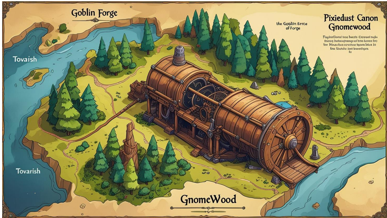
EXHIBIT 3 PIXIEDUST CANNON