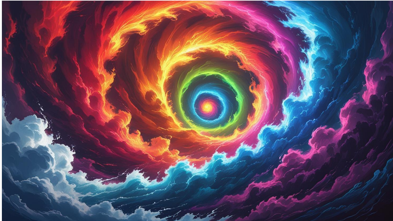
EXHIBIT 4 - RAINBOW OF DESTRUCTION